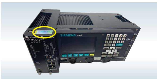
Product Label placement on all controllers containing the ATC Cabinet Compatible Backplane

The following Product Label will be included on all controllers which contain the ATC Cabinet Compatible Backplane. In order to connect any m60 series controller to an ATC Cabinet, an ATC Compatible Backplane and ATC Cabinet Module are needed.