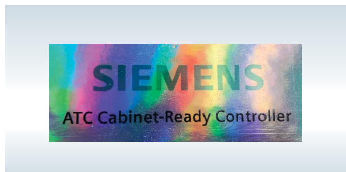
Product Label indicating presence of ATC Cabinet Compatible Backplane